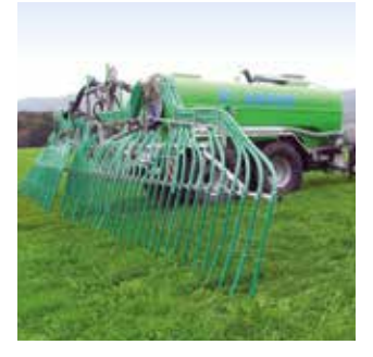
Trailing hose applicator Modular system for all types of tankers