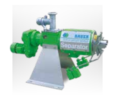
SEPARATOR Press screw separator for solid-liquid separation