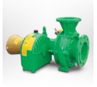
MAGNUM SM Thick matter pump gear unit design