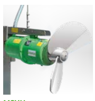
MSXH Submersible motor mixer