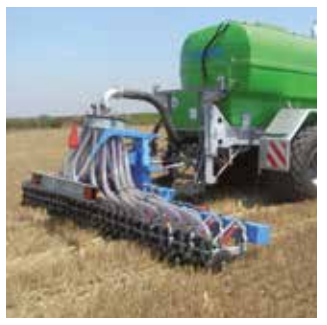
Slurry injector Innovative spreading technology