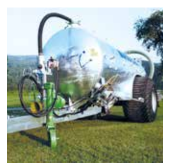
Slurry tankers and polytanker Different tanker types for every requirement