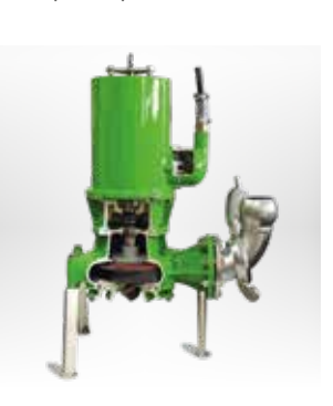
MAGNUM CSPH Submersible motor pump gear unit design