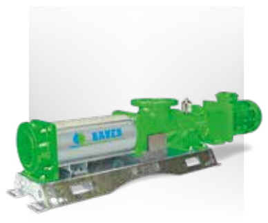
HELIX DRIVE Eccentric screw pump