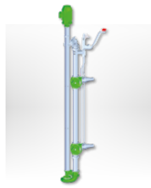
MAGNUM LEE/LEC Long shaft pump