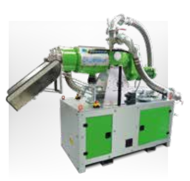
SEPARATOR PLUG & PLAY System for portable slurry separation